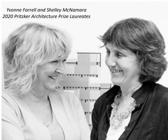
Yvonne Farrell and Shelley McNamara 2020 Pritzker Architecture Prize Laureates